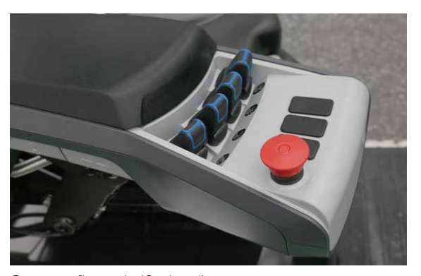
Grammer fingertip (Optional)

Silence, no pollution, energy saving and other advantages meet the environmental protection requirements.